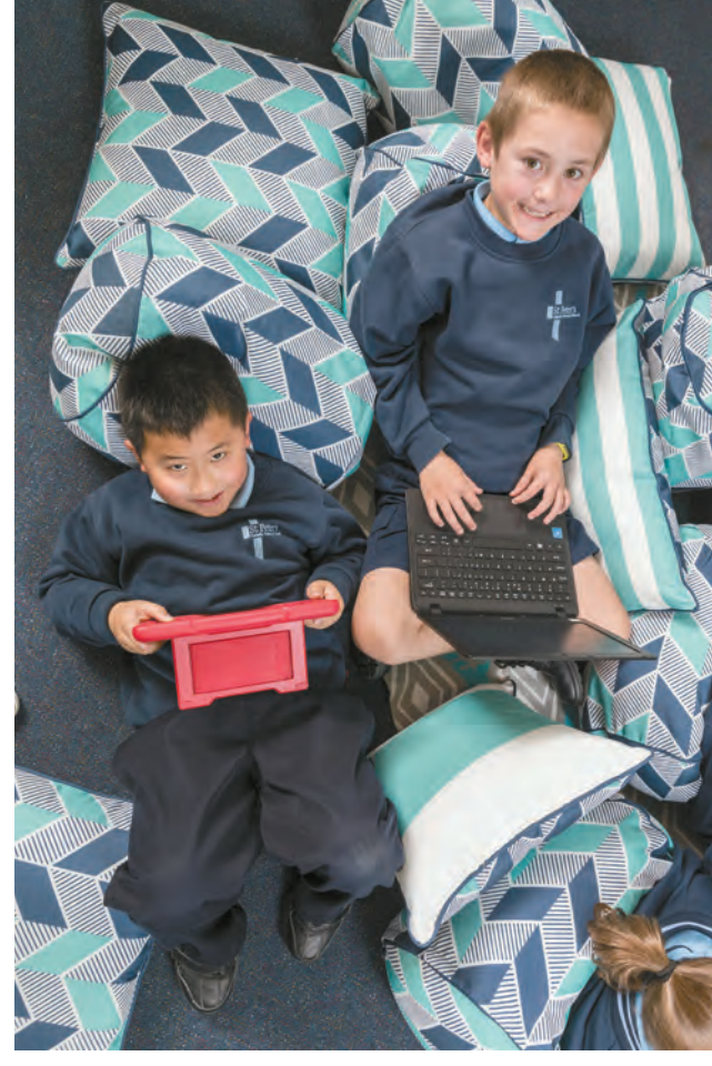
Students at St Peter's School in South West Sunshine

Nonetheless, recently we've seen multiple articles in the media on high levels of NAPLAN-related stress among students. The Herald Sun has reported on acute levels of anxiety among Australian students by comparison to their global peers. A study by the Organisation for Economic Co-operation and