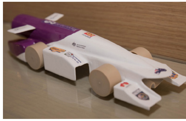
Fastest ever F1 in Schools™ car, designed and built by Infinitude (p. 6)

Last year students from a group of Catholic schools across Melbourne took part in the Formula 1 Challenge, an international school STEM contest run with local support from Deakin University.