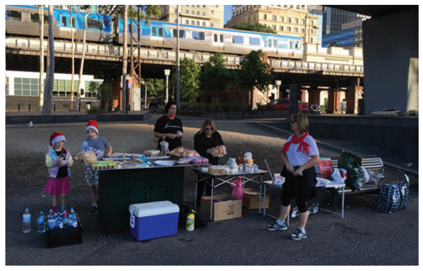
Hayden's Helping Hands feeds Melbourne's homeless at its annual Christmas Eve BBQ

The Church marks the end of the year with Advent, four weeks of waiting and preparing for the celebration of the birth of Jesus at Christmas, as well as his return at the second coming.