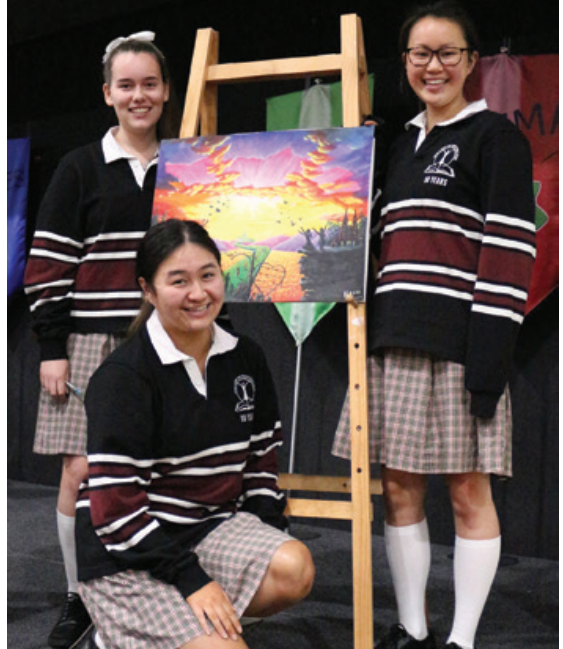
Our Lady of Sion students with the painting they commissioned for the college

We witness injustice – when we learn that the majority of people we visit have been detained for five or more years. That is the same length of time in which we have completed our entire high school education.